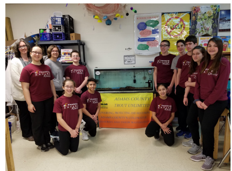
Saint Francis 8th grade TIC students and teachers