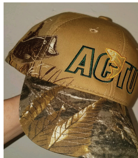
New chapter hat for 2019