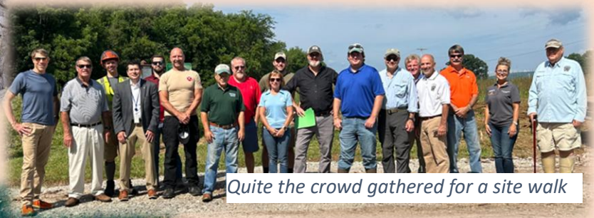
Quite the crowd gathered for a site walk